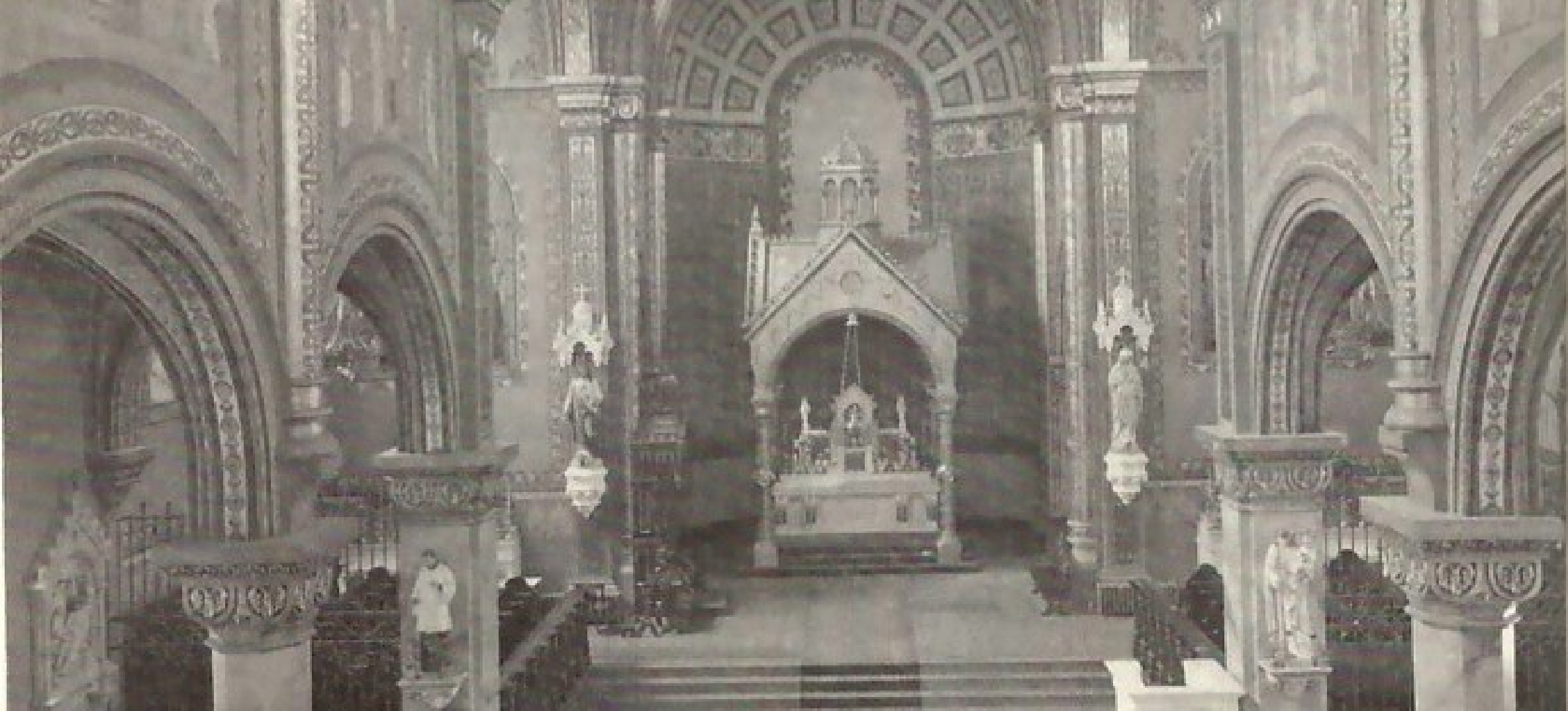
Abbey Church--ca. 1888