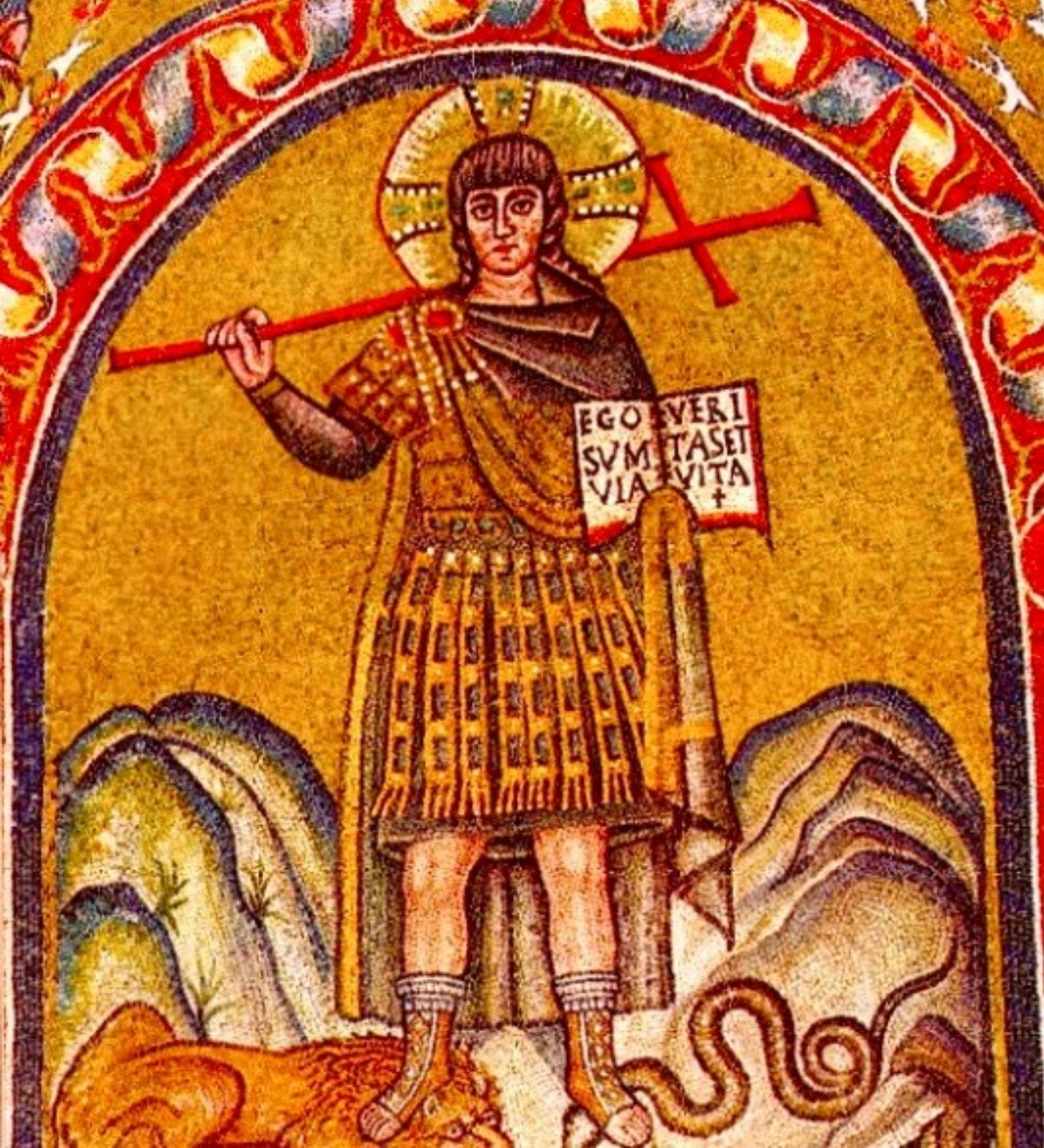
Ancient Church of Ravenna, Northern Italy