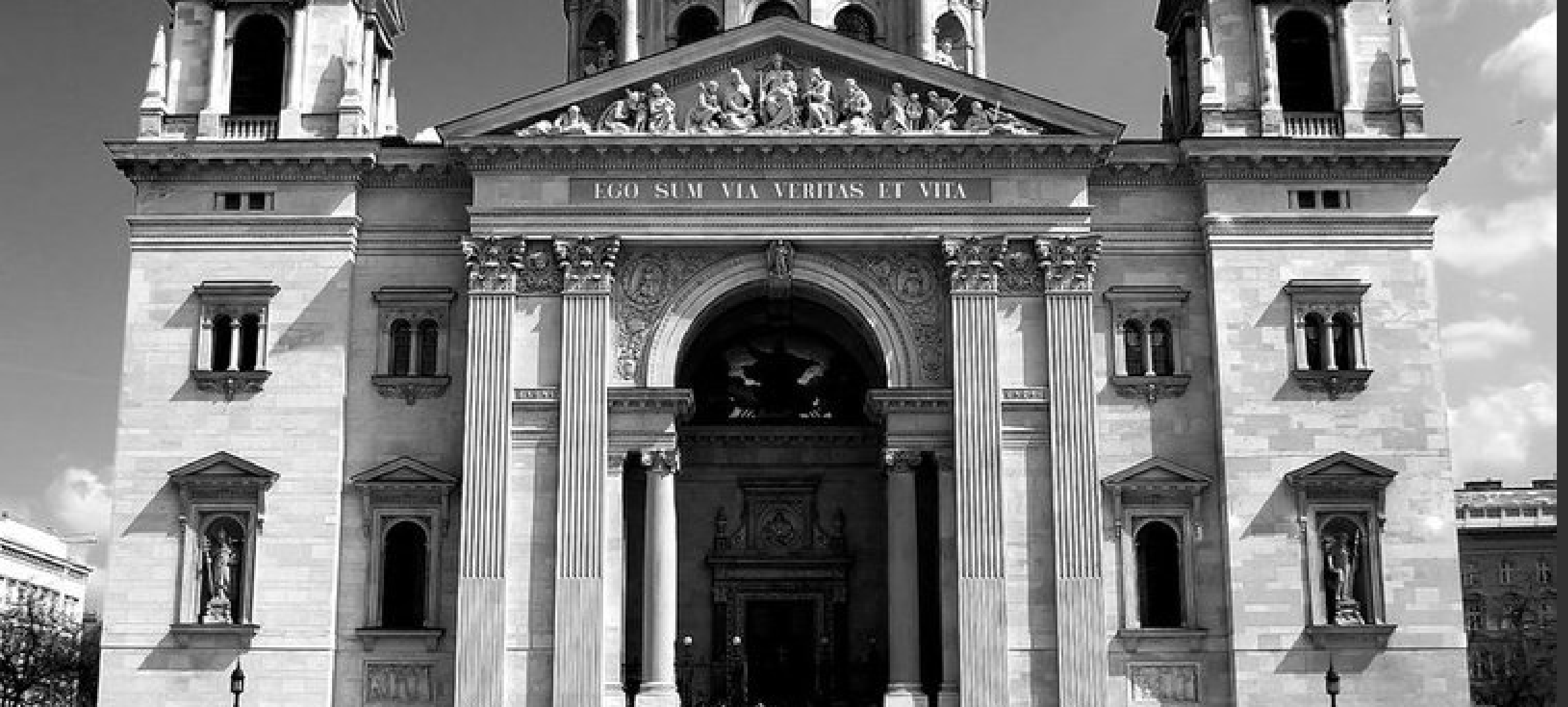
Basilica in Budapest, Hungary