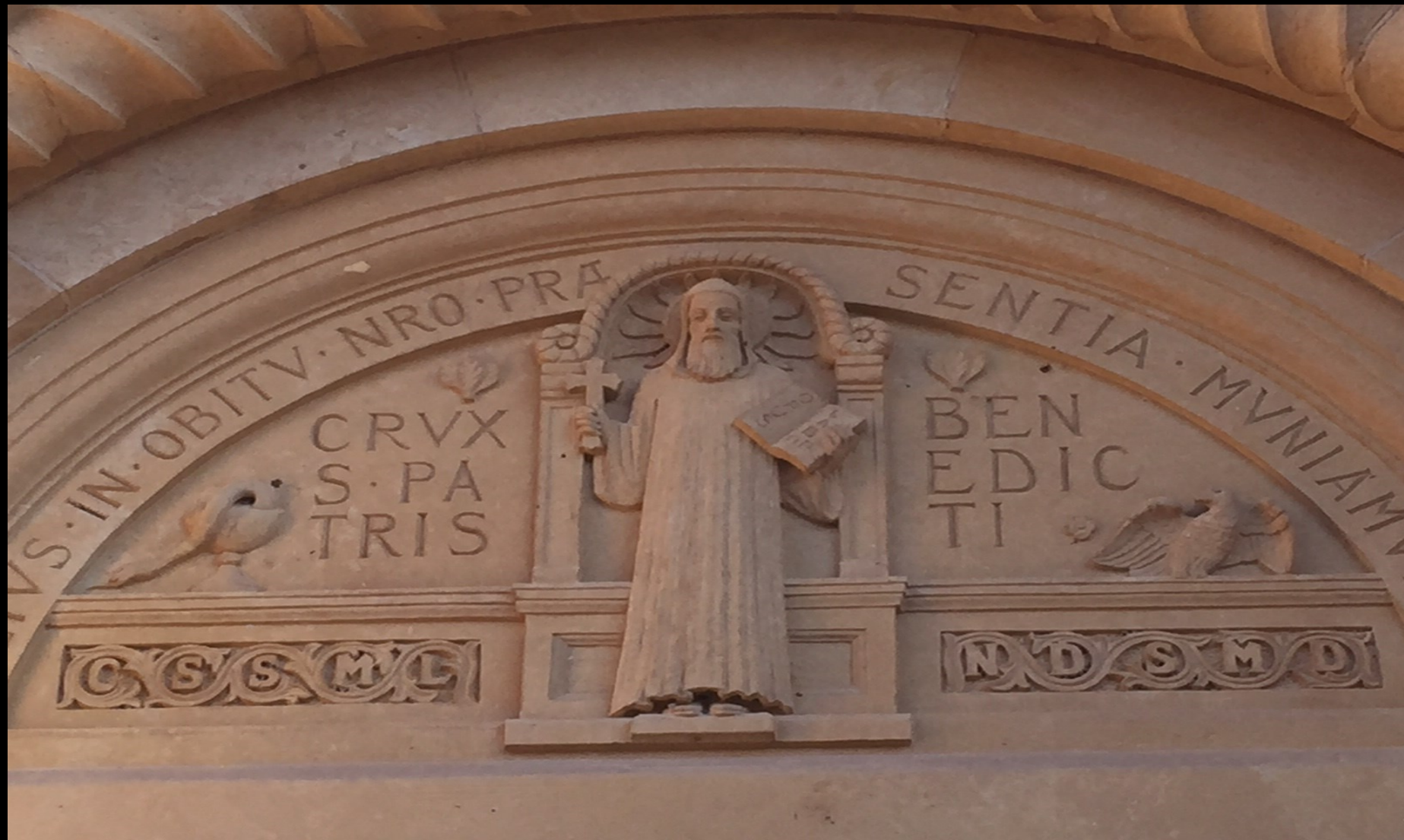
Music Building Tympanum