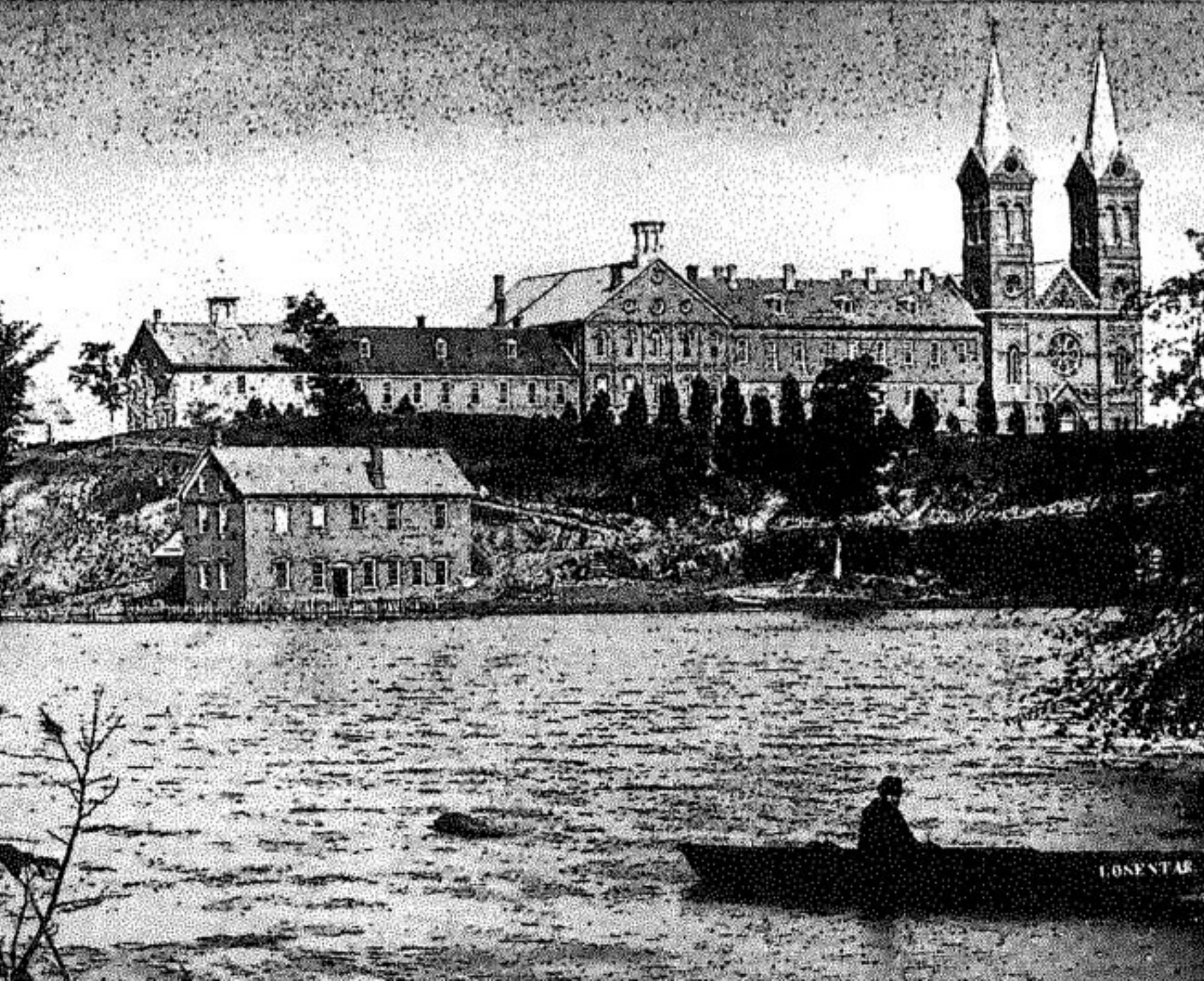
View of Former Abbey Church with original steeple in view from Lake Sagatagan.