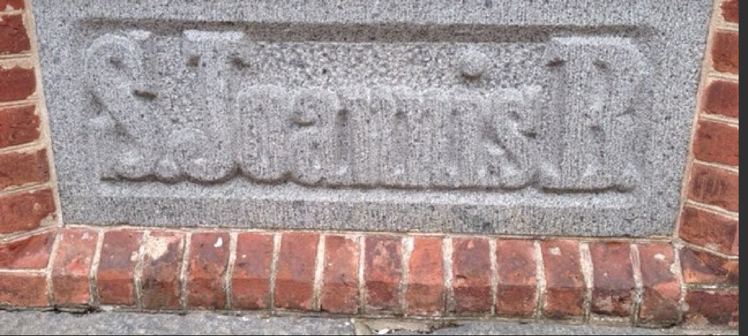
Cornerstone of Great Hall: S. Joannis B.