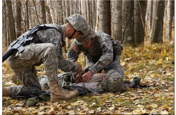
FSB Ranger Challenge Team on a medical lane during the Task Force Competition.