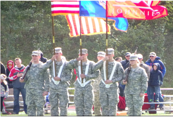
Fighting Saints Color Guard during a St. John's University football game.