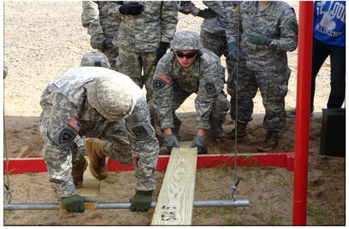
Cadets working as a team on confidence course during the Fall FTX.