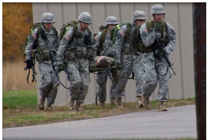
FSB Ranger Challenge Team during the Task Force Ripley Medical Event.