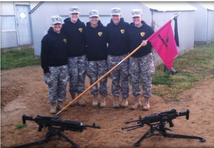
FSB All-Female Ranger Challenge Team during the Task Force Ripley Competition.