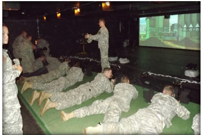
FSB Cadets during an Engagement Skills Training Exercise at Camp Ripley, MN.