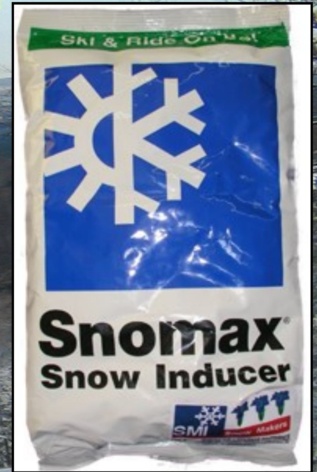
The picture above shows Snomax, a biological additive that aids in snow crystallization. The table on the left shows the advantages and disadvantages of each snowmaking system.